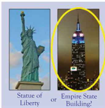
Statue of Liberty or Empire State Building?