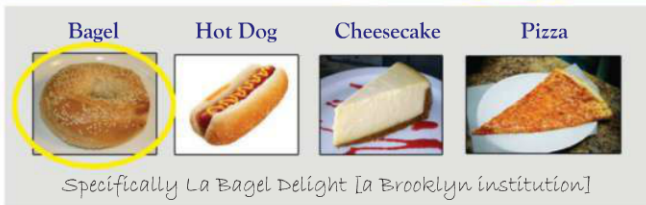
Bagel Hot Dog Cheesecake Pizza

Specifically La Bagel Delight [a Brooklyn institution]